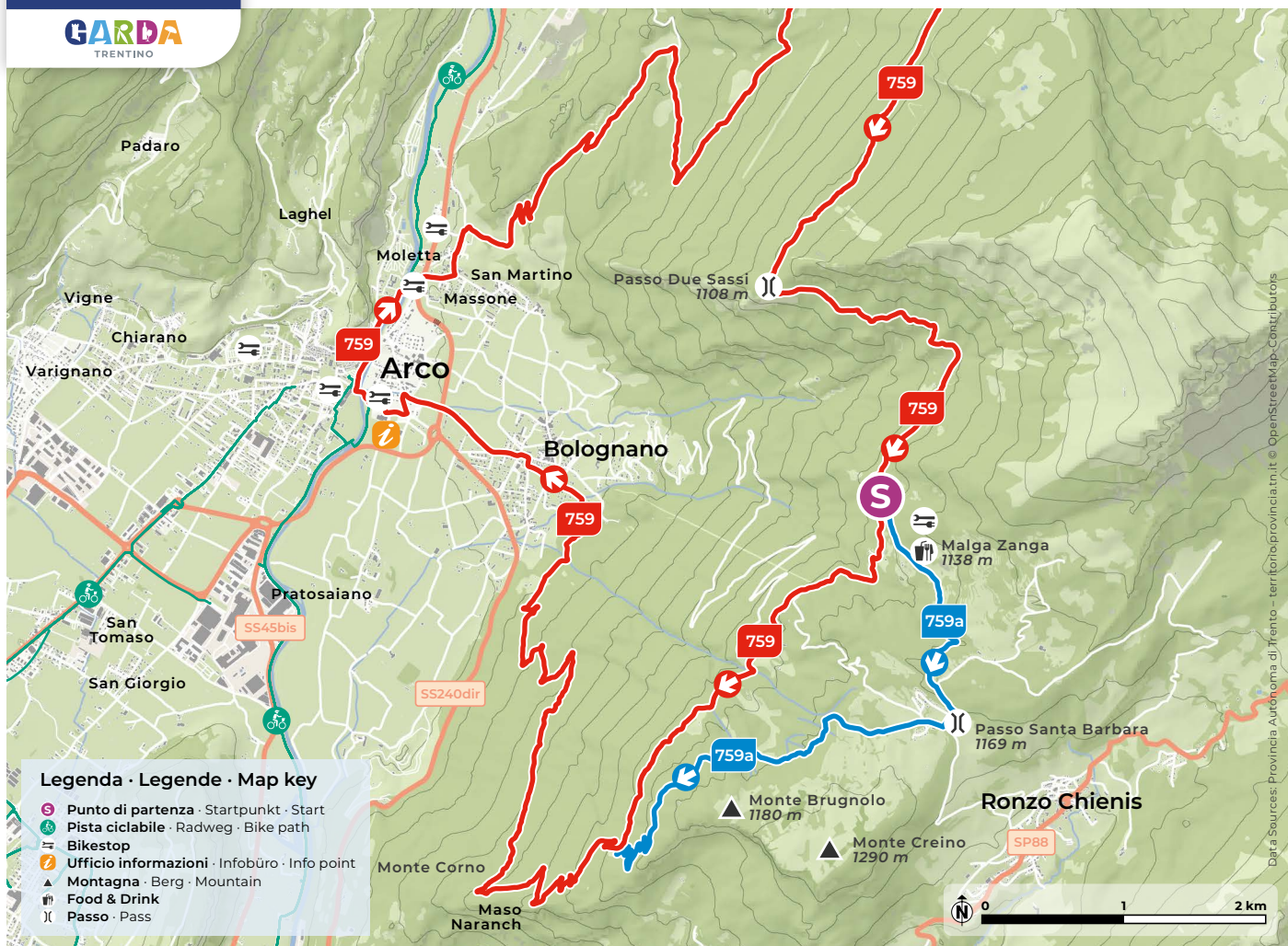
Design and cartography 2023 | max2.at